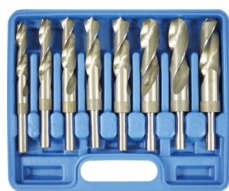
D117 Metric HSS Reduced Shank Drill Set