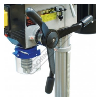
1 Piece Cast Iron Drilling Lever