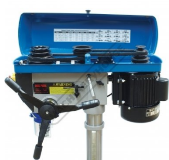
A Section Belt Drive System