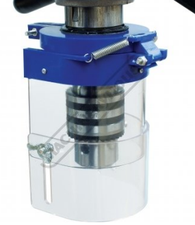
Adjustable Safety Chuck Guard with Flip Up Screen Safety Chuck Guard Flipped Up