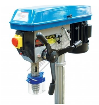
80mm Spindle Travel