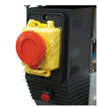
Emergency Stop Switch and Light Switch Work Light