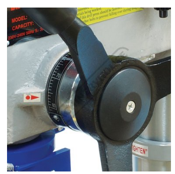
Drilling Depth Stop Setting With Scale Safety Micro Switch on Pulley Guard Head Side View