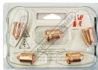
Packaging Rear View