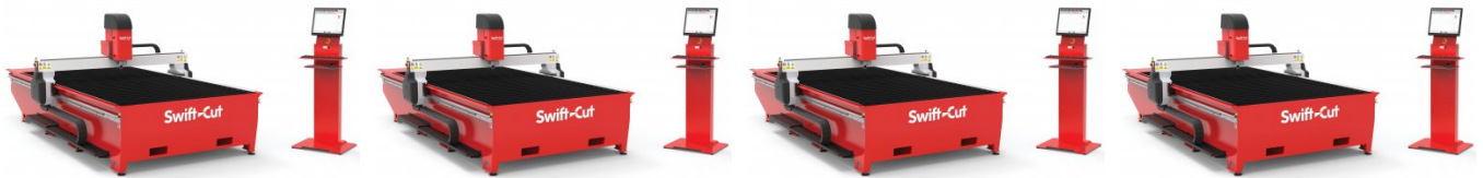
P9033 CNC Plasma Cutting Table