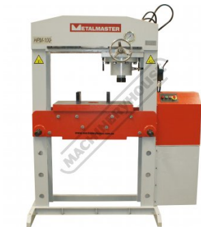
Front View Head Right Position