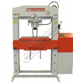
Table Height Adjustment Lift Chain