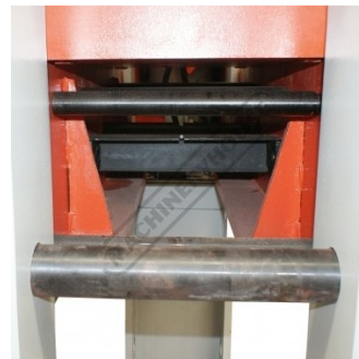
Table Chain Lifting Point