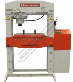
Front View Head Left Position