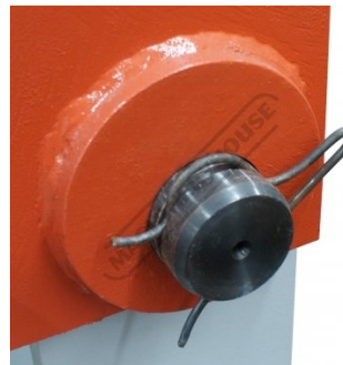
Pin Safety Clip