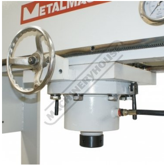
Sliding Ram Head Adjustment Handle