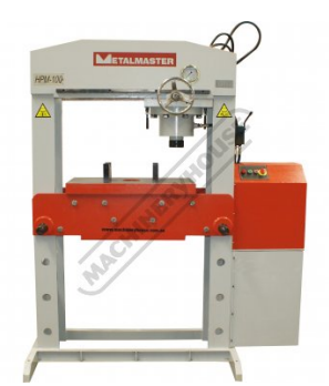
Front View Head Right Position