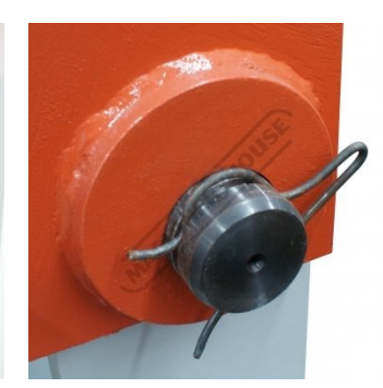
Pin Safety Clip