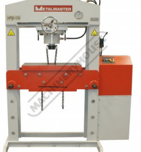
Table Height Adjustment Lift Chain