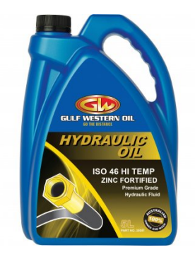
O004 Superdraulic 46 Hydraulic Oil

O002 Superdraulic Hi Temp 46 Hydraulic Oil