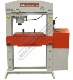
Front View Head Left Position