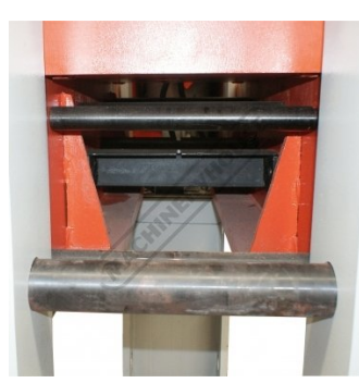
Table Chain Lifting Point