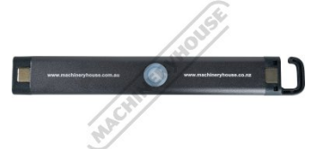
Two Magnetic Points