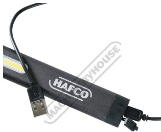
USB Charge Port