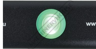
Power Light Indicator