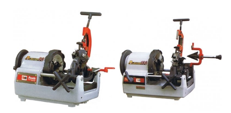
T024A Pipe Threading Machine -Automatic Die Head