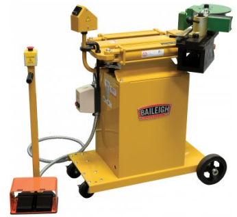
B8080 Hydraulic Pipe & Tube Rotary Draw Bender