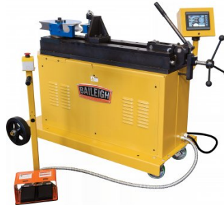
B8095 Motorised Pipe & Tube Rotary Draw Bender