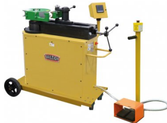
B8090 Motorised Pipe & Tube Rotary Draw Bender