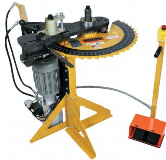
B8075 Hydraulic Pipe & Tube Rotary Draw Bender