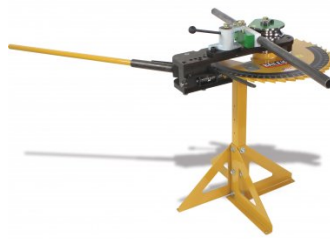
B8070 Manual Pipe & Tube Rotary Draw Bender