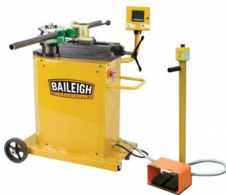
B8085 Motorised Pipe & Tube Rotary Draw Bender