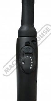
Amperage Control Dial and On Off Button