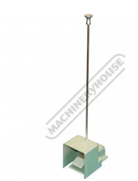
Roving Foot Pedal