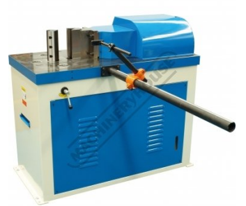
1000mm Manual Backgauge