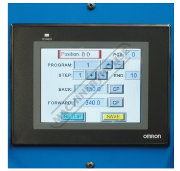
Touch Screen NC Control