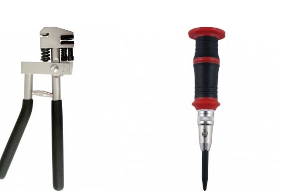
S200 Joggler & Punch Plier