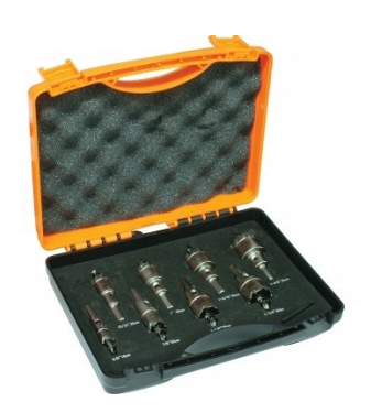
D102 Metric HSS Hole Saw Set