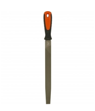
F122 Engineers File, Flat - Smooth Cut