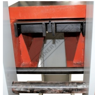
Table Height Adjustment Chain Slot