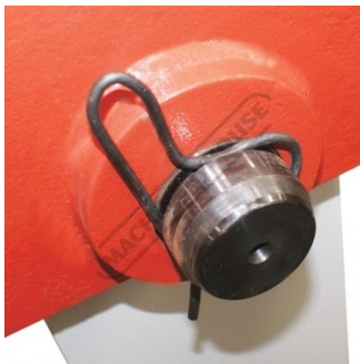
Pin Safety Clip