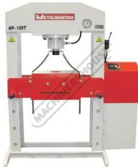
Table Height Adjustment With Chain