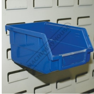
Plastic Bucket Container