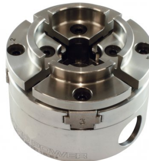
R8197 Scroll Chuck - 90mm - with Bonus 50mm Face Plate Ring