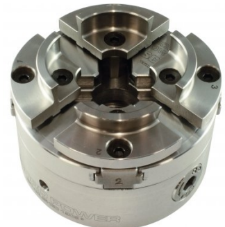
R8175 Scroll Chuck - 100mm - with Bonus 50mm Face Plate Ring