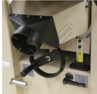
Dust Chute Set Up For Planer