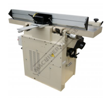
Rear Right View