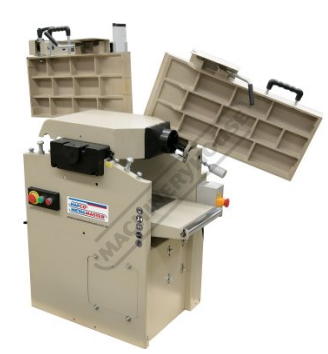
Set Up as a Thicknesser