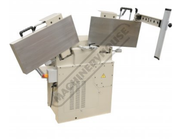
Thicknesser Setup - Rear View