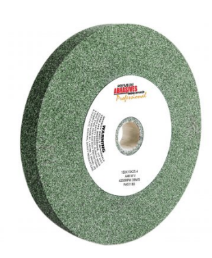
G171 White - Alox Grinder Wheel