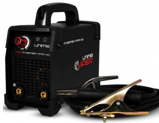
W165 STICK WELDER