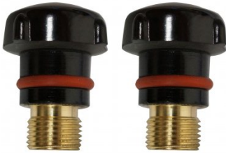
W589 2 x Short Back Caps