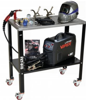
K018 MIG/STICK WELDER Package Deal