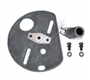
Shown Fitted to PD-325 Drilling Machine Bolt On Locating Spigot