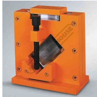
Optional Channel Shearing