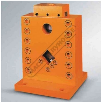
Optional Bar Shearing