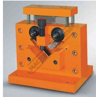
Optional Angle Shearing