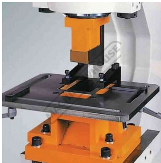
Optional Rectangular Notcher