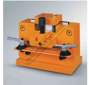
Optional Flat Bar Shearing