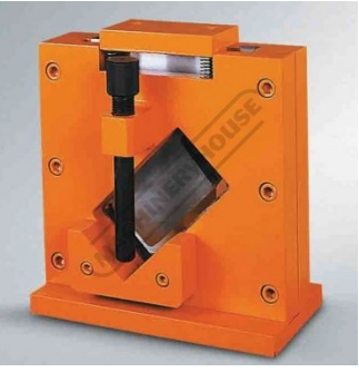
Optional Channel Shearing