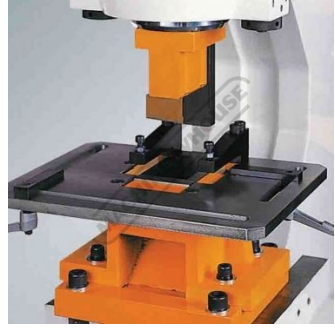
Optional Rectangular Notcher