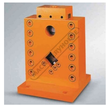
Optional Bar Shearing