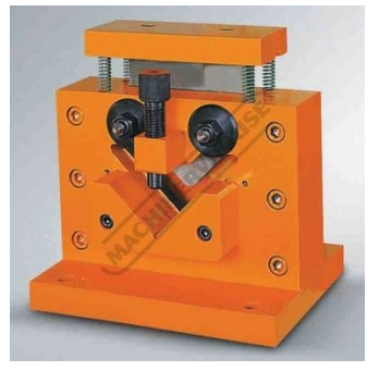
Optional Angle Shearing