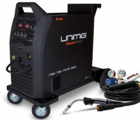
W181 MIG/TIG/STICK WELDER