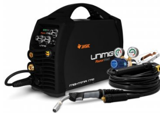
W177 MIG/STICK WELDER