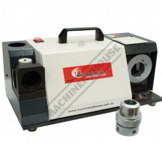
Shown with Drill Chuck