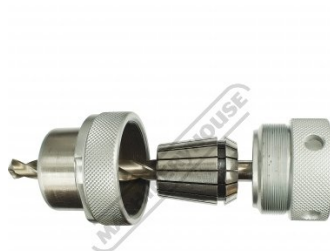
Collet Chuck Drill Holder