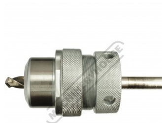
Collet Chuck Drill Holder Assembled