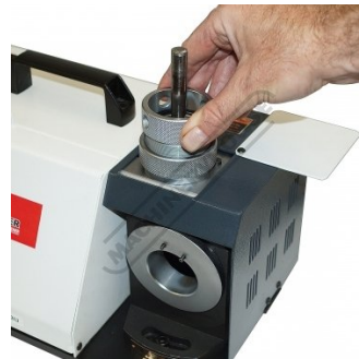
Grinding Split Point Station