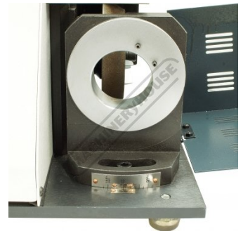
Drill Angle Setting