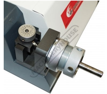
Drill Setting Gauge