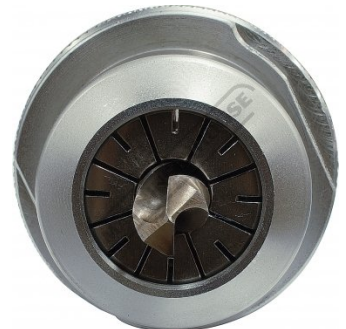
Drill Bit in Drill Chuck End View