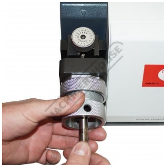
Setting Up 12mm Drill Bit