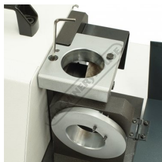
Setting the Centre Point Lock Screw