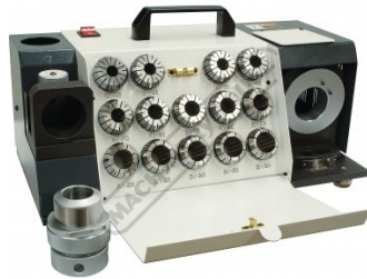
ER40 Collet Set Storage