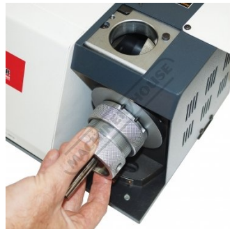
Sharpening Drill Bit Station