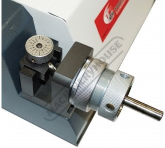
Drill Setting Gauge