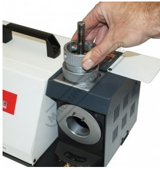
Grinding Split Point Station