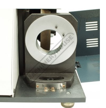
Drill Angle Setting