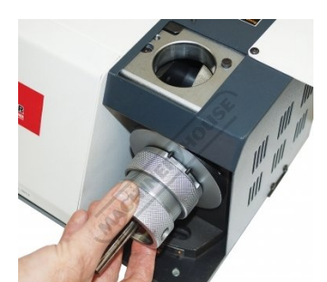
Sharpening Drill Bit Station