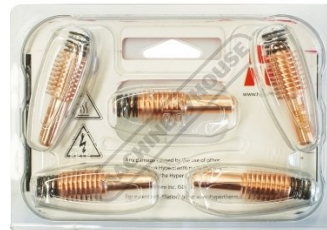
Packaging Rear View