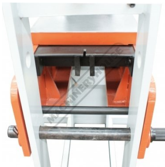
Table Height Adjustment Chain Slots