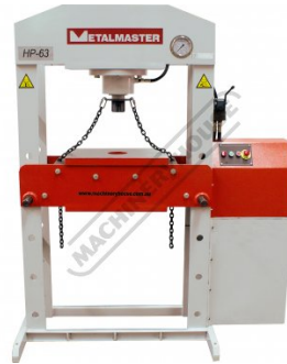
Table Height Adjustment Chain