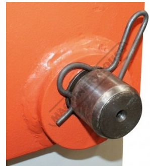
Pin Safety Clip