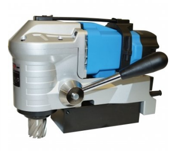
D9507 Portable Magnetic Drill - 3MT