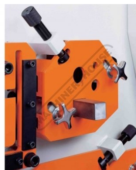
Square Bar Shear