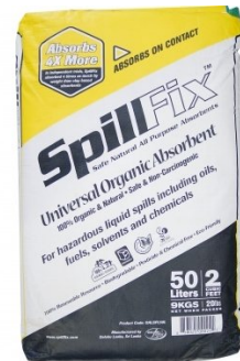
O000 SpillFix Universal Organic Absorbent