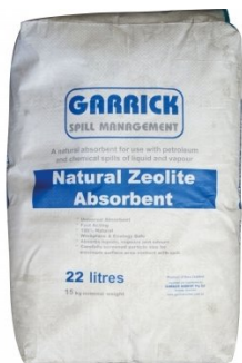
O000A Natural Zeolite Absorbent