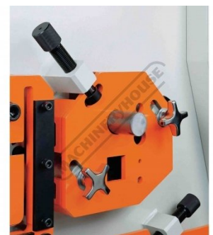
Round Bar Shear