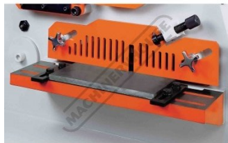
Flat Bar Shear