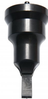
P6001 8 x 8mm Square Punch