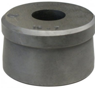
P726A Ø26.7mm Round Die - RDN1