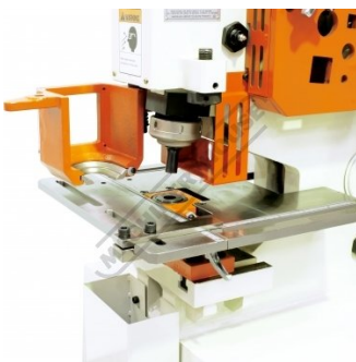
Work Table with Adj. Stops