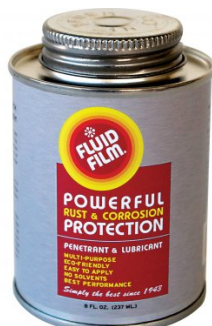
O043 Rust & Corrosion Preventive - Penetrant & Lubricant