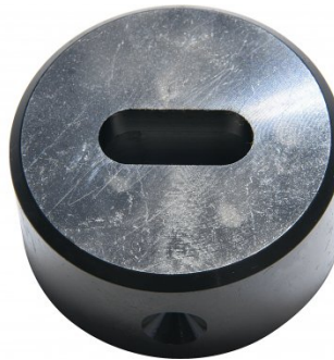
P6006 8.7 x 20.7mm Slotted Die