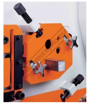
Square Bar Shear