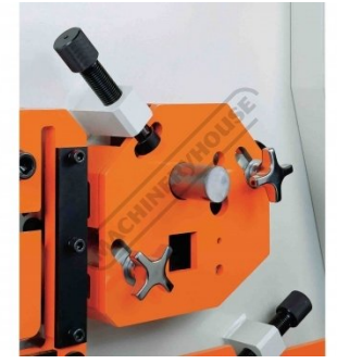
Round Bar Shear