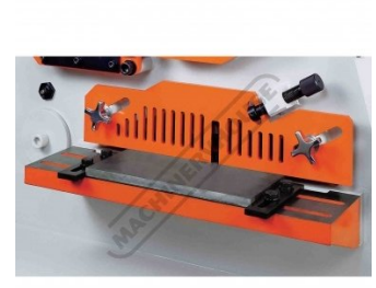
Flat Bar Shear