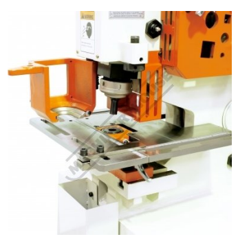
Work Table with Adj. Stops