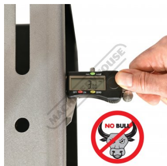
3mm Thick Bench Top