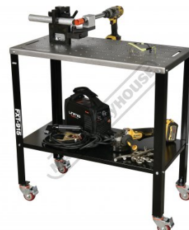
Shown Setup as a Work Bench (Accessories not included)