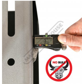
3mm Thick Bench Top