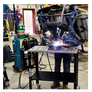
In Use Welding

Shown Setup as a Work Bench (Accessories not included)