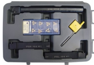
L465 Professional Lathe Parting Tool Kit - Insert Type