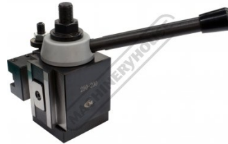
Toolpost With Holder