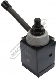
Toolpost Rear View