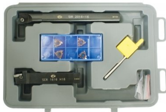
L0077 Lathe Turning Tool Kit - 7 piece Insert Type