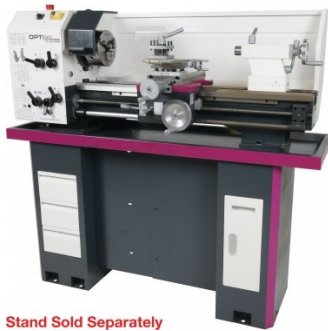
L691 Opti-Turn Bench Lathe