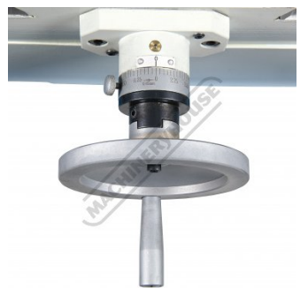
Table Cross Feed Dial