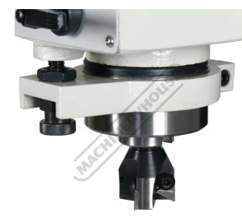
Includes Face Mill Cutter