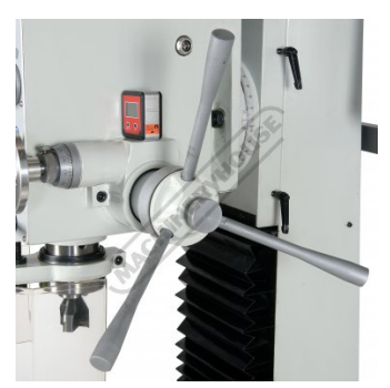
Quill Feed Lever

sales@machineryhouse.com.au www.machineryhouse.com.au