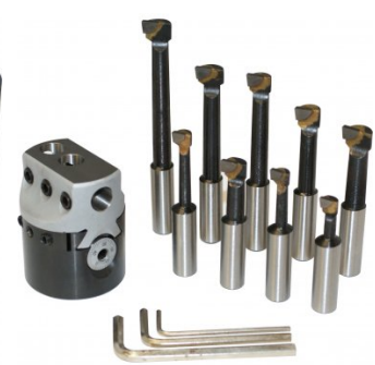
M192 Boring Head Shank