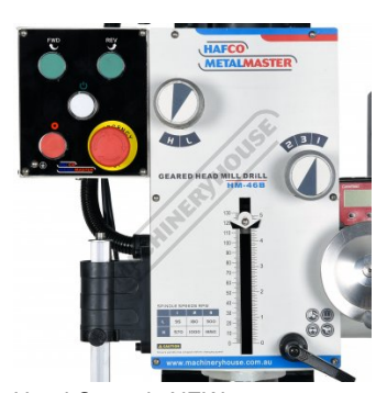
Head Controls NEW