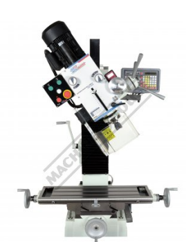
Tilt Head Right