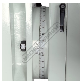
Tilting Head Scale