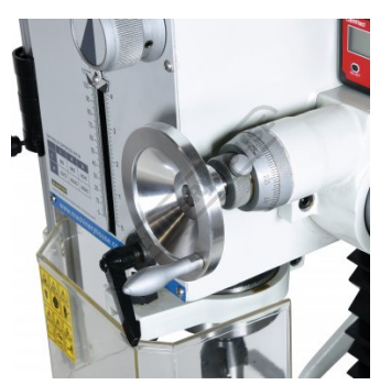
Fine Quill Feed Handwheel