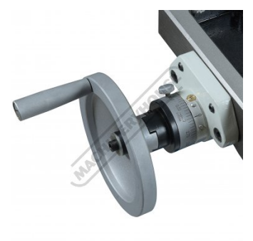
Table Longitudinal Dial