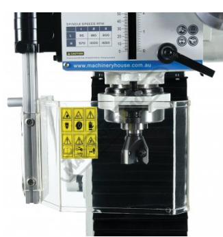
Swivel Safety Guard