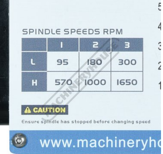
Spindle Speed Chart