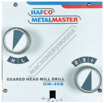
Spindle Speed Selectors