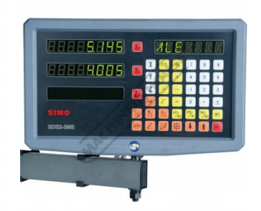
3 Axis Digital Readout Counter Fitted with 2 Axis X Y Scales Only