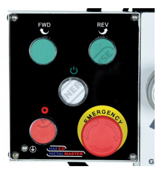
Forward Reverse ON OFF-Emergency Switches