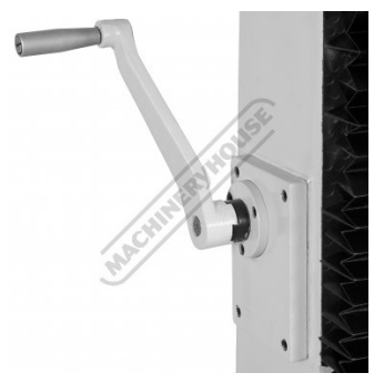
Rack And Pinion Wind Up Head