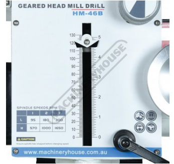
Quill Depth Stop Scale-Spindle Lock