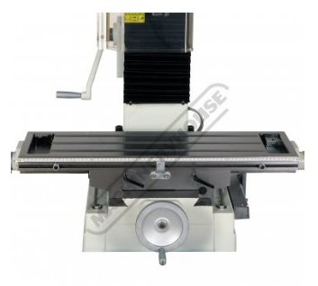
Ground Work Table with T Slots