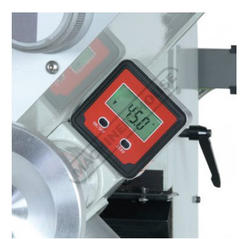
Digital Tilting Head Gauge