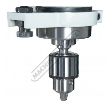
Includes Drill Chuck