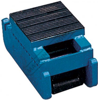
Shown With Optional Skate