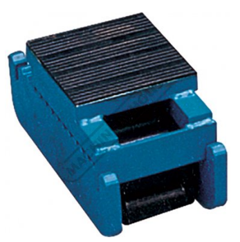
Shown With Optional Skate