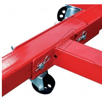
Fold Up Legs Release Pins