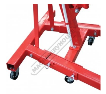
Fold Up Legs with Pins