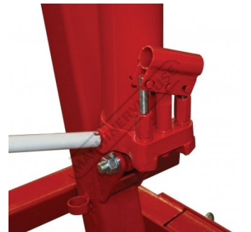
Ram Release Valve