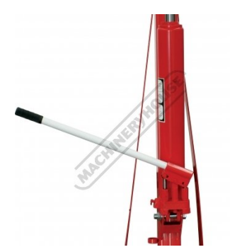
Hand Operated Pump

sales@machineryhouse.com.au www.machineryhouse.com.au