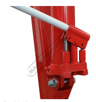
Double Action Pump