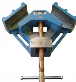
V100 90 degree Angle Vice Clamp