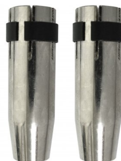
W555 2 x Conical Nozzles