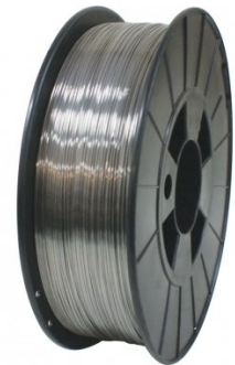
W145 Ø0.9mm Gasless Mild Steel MIG Welding Wire