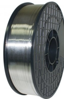
W144 Ø1.2mm Aluminium MIG Welding Wire