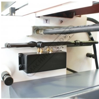
Table Direction Micro Switches