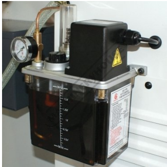
Auto Lubrication Pump