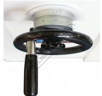
Cross Feed Dial