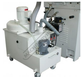
Optional Dust Collection System