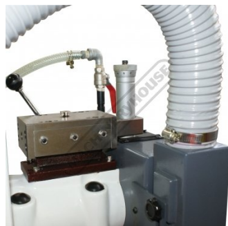
Parallel Wheel Dresser Micro Adjustment