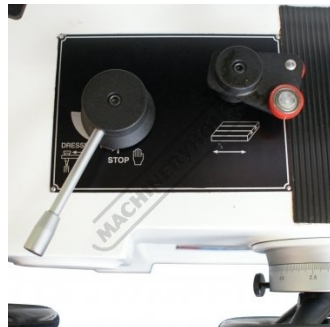
Hydraulic Table Feed Control with Rapid