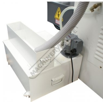
Coolant Pump & Tank