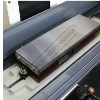
Electro Magnetic Chuck