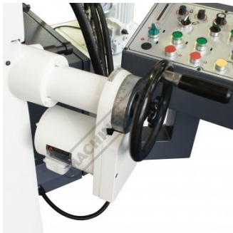
Fine Feed Height Adjustment Dial