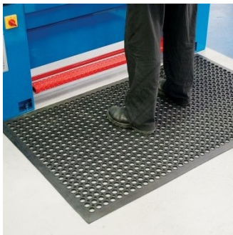
Shown Being Used with a Lathe