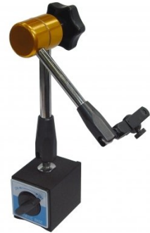
M051 Magnetic Base - Deluxe - One Lock