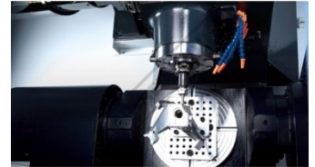
DNM350 5AX Workpiece