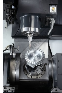
DNM200 5AX Workpiece