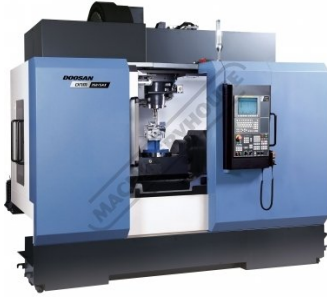
DNM 3505AX Side open