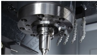
DNM 5AX Spindle