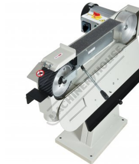
Platten Table has Graphite Wear Resistant Pad