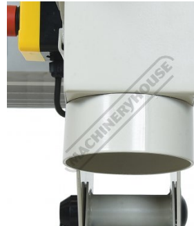
100mm Front Dust Chute