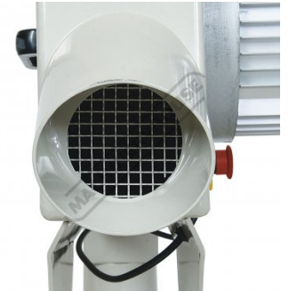
100mm Rear Dust Chute