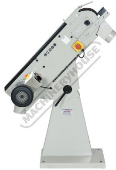
Head Tilting Up