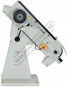
Head Tilting Down