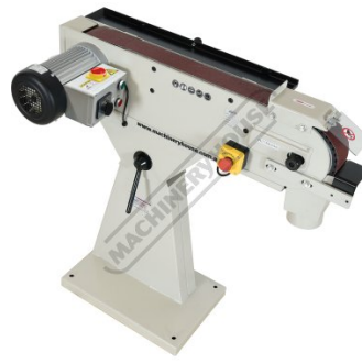
Large 75 x 465mm Woring Surface