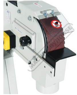
Safety Eye Shield Job Rest