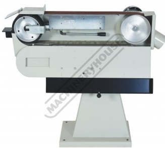
Side Open for Belt Replacment