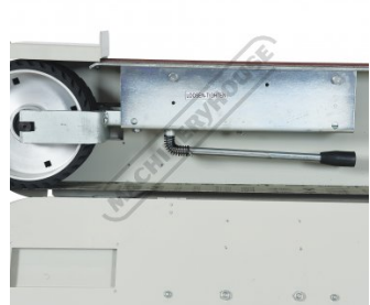
Quick Change Belt Change Lever