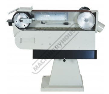
Side Open for Belt Replacment