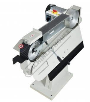
Platten Table has Graphite Wear Resistant Pad Side View