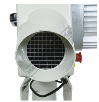
100mm Rear Dust Chute