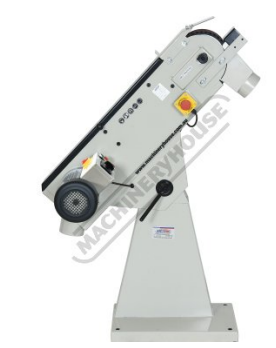
Head Tiltiing Up