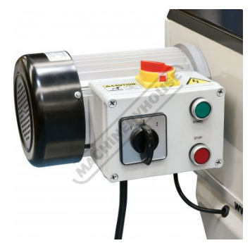
2 Speed Motor and On Off Switch