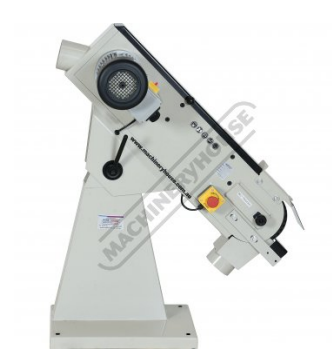
Head Tiltiing Down