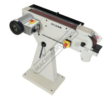
Large 75 x 465mm Woring Surface Safety Eye Shield Job Rest