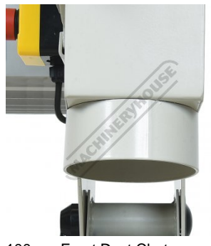
100mm Front Dust Chute