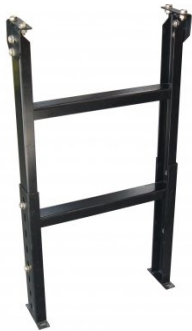
W343A Roller Stand