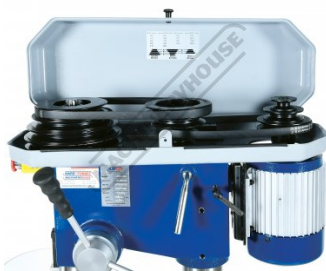
B Section Belt Drive System