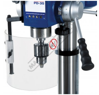
Drill Chuck Safety Guard With Micro Switch