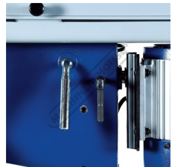
Belt Tension & Lock Lever