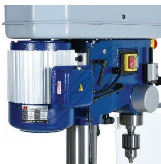
240V 1HP Motor