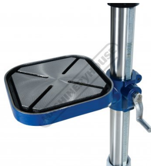
Table Rack Pinion Wind Up