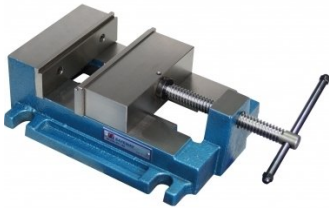
V143 Safeway Precision Drill Press Vice