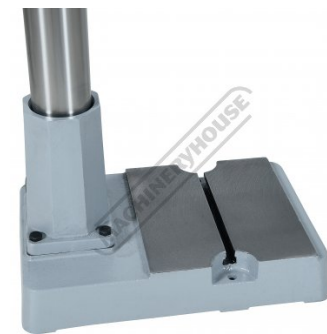
Heavy Duty Base with T Slot