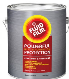
O044 Rust & Corrosion Preventive - Penetrant & Lubrication