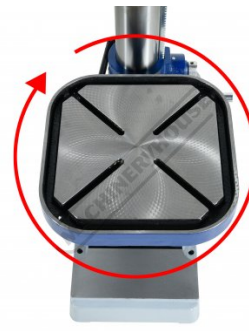
Cast Iron Table Rotates 360 Degree