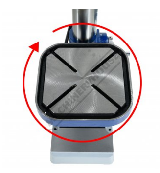
Cast Iron Table Rotates 360 Degree Belt Tension & Lock Lever