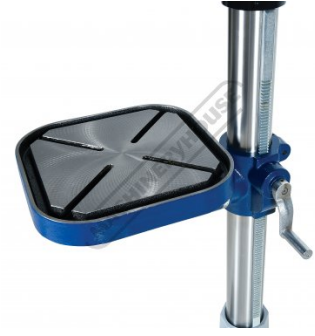
Table Rack Pinion Wind Up