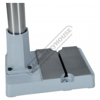
Heavy Duty Base with T Slot