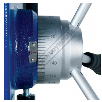
Drilling Depth Stop Setting With Scale Drill Chuck Safety Guard With Micro Switch