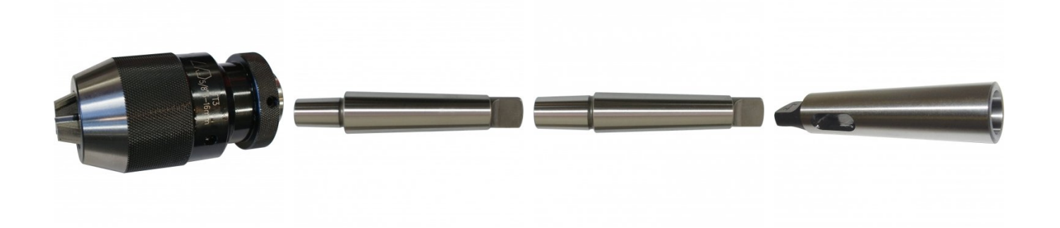
D422 Drill Sleeve - Morse Taper