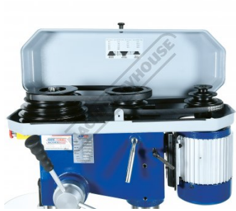
B Section Belt Drive System