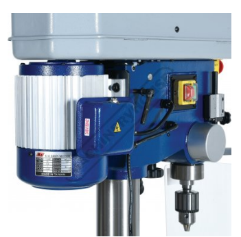
240V 1HP Motor