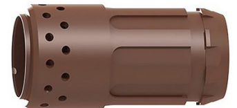
P8432 Hypertherm 45XP/65/85 Swirl Ring FlushCut