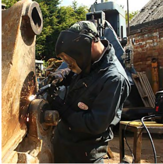
Powermax 45XP In Use