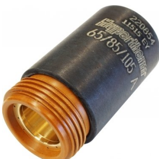
P8382 Hypertherm 45XP Nozzle Max Control Gouging