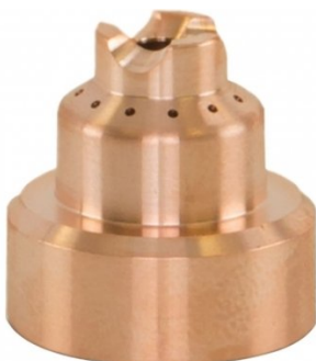
P8452 Hypertherm Shield Drag Cutting Suits Hand Torch