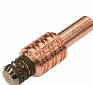
P8371 Hypertherm 45-105A Copper Plus Electrode