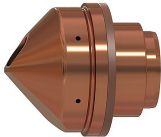
P8385 Hypertherm 45XP/65/85/105 Nozzle-Shield FlushCut