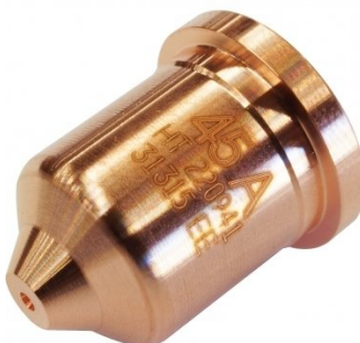
P838 Hypertherm 45A Nozzle