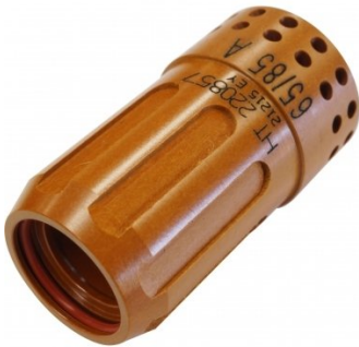
P843 Hypertherm 45-85A Swirl Ring