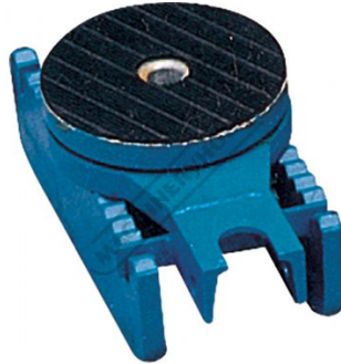
Shown With Optional Skate