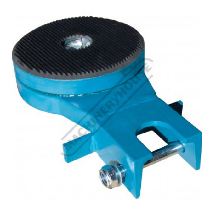
Suits 10 - 15 Tonne Garrick Load Skates