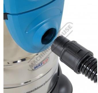
Quick Connect Hose