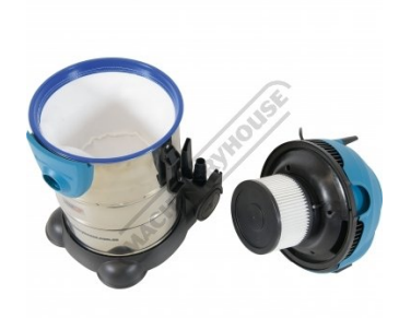
Shown With Head Apart