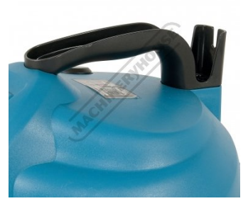
Top Carry Handle