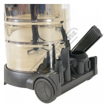
Accessory Storage Rear