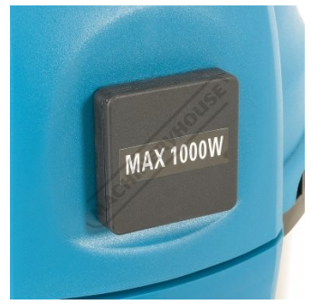
240V Power Socket