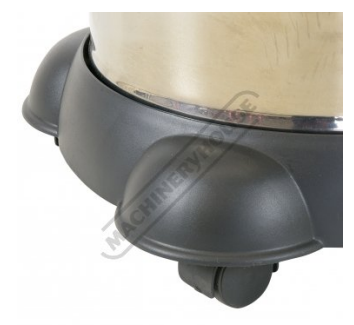
Front Swivel Wheels