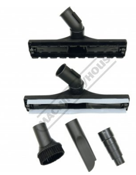
Includes Hose Attachments