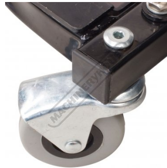
4 x Swivel Wheels