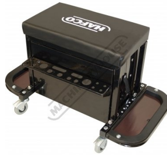
Rear Tool Storage Support