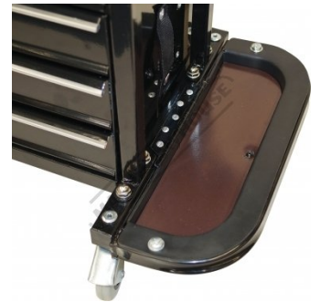
Magnetic Base Parts Tray