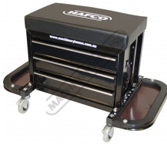
Side Trays Shown Down