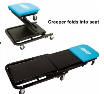
Creeper folds into seat

A006 Heavy Duty 2 in 1 Mechanics Creeper & Seat Combination