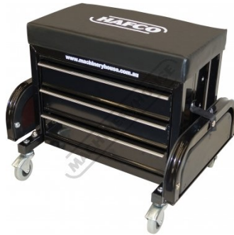
Side Trays Shown Folded Up