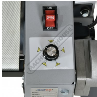
Variable Speed Dial