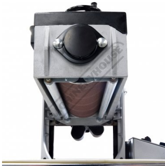
Sanding Wheel with Rollers