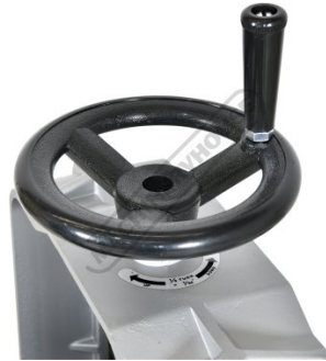
Handle For Height Adjustment