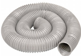
W3985 PVC Dust Hose (Sold Per Metre)