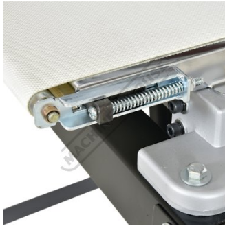
Belt Tension Adjustment