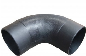
W336 Dust Hose Elbow